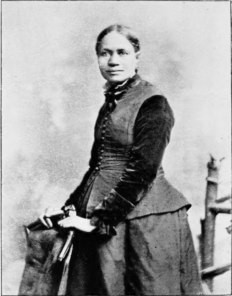
Frances C. W. Harper.